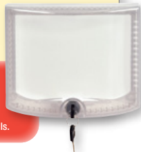
5970 Thermostat Guard