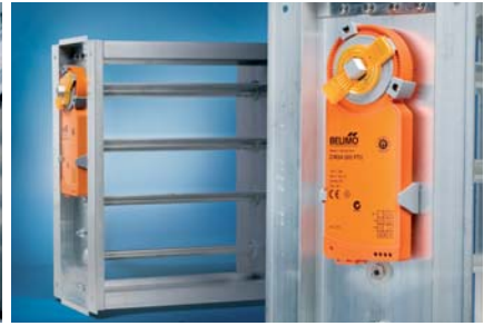
Air Control Dampers