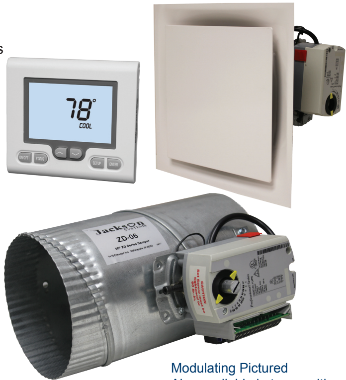
Modulating Pictured Also available in two-position