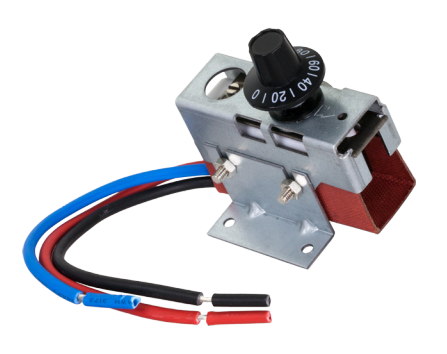
iO-DFK-ODT included in kit