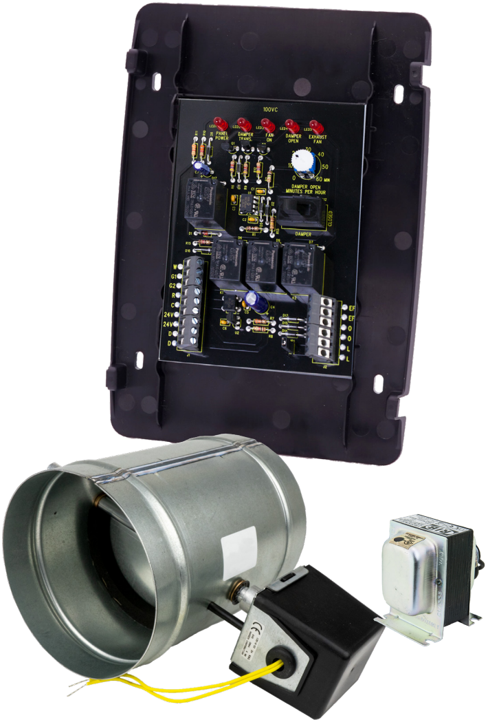
Panel cover included

The Fresh Air Ventilation system is designed to introduce fresh air into a home through an intake damper controlled by a micro-processor logic panel. The iO-FAV has single adjustment setup, exhaust fan control option, outdoor temperature and/or humidity limit option and damper override capabilities. It is easy to install and meets ASHRAE Standard 62.2. The iO-FAV kit comes with a control panel, 20VA transformer and round damper. The control panel is available separately (iO-FAVPAN) and can be ordered with additional size dampers. Metal Enclosure (iO-PAN-ME) available as an additional option on iO Zone Panels.