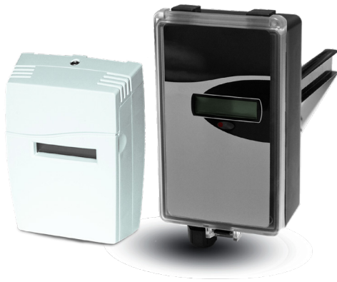
Sensors sold separately

Connecting the CO2 sensor to the over-ride terminals on our Fresh Air Ventilation panel activates the On Demand Ventilation function to provide fresh air into areas or rooms with high concentrations of CO2. Contact iO HVAC Controls for engineering and installation instructions and schematics.