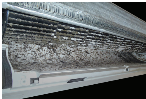
Mold thrives on mini-split blower wheels