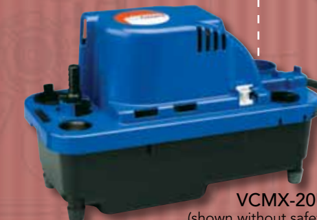
VCMX-20UL (shown without safety switch)