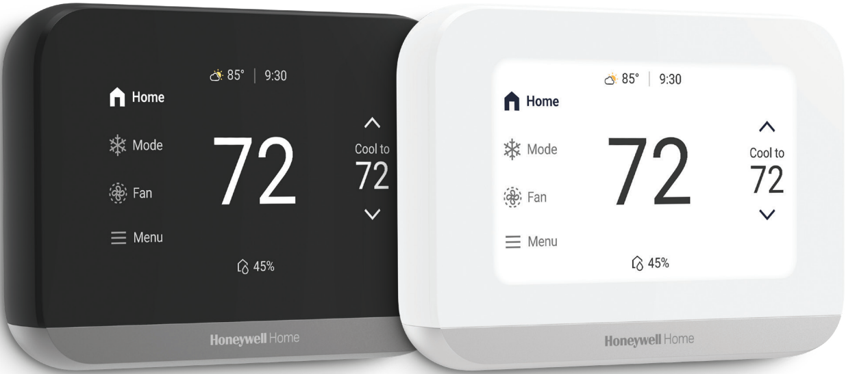
ELITEPRO™ S1000 SMART THERMOSTAT THX1000W1/U - WHITE THX1000B2/U - BLACK